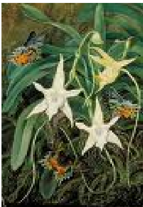
Angraecum and Urania Moth of Madagascar